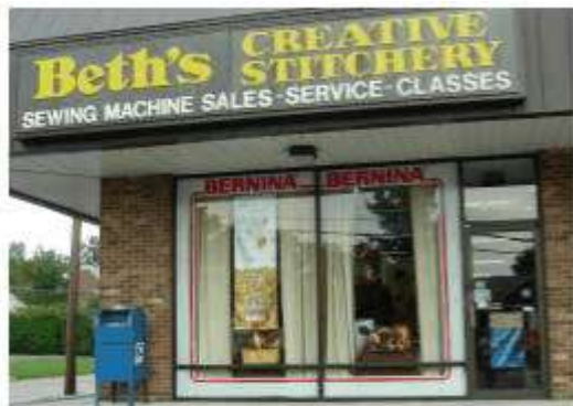
At Beth's Creative Stitchery, we change the way you think about sewing.